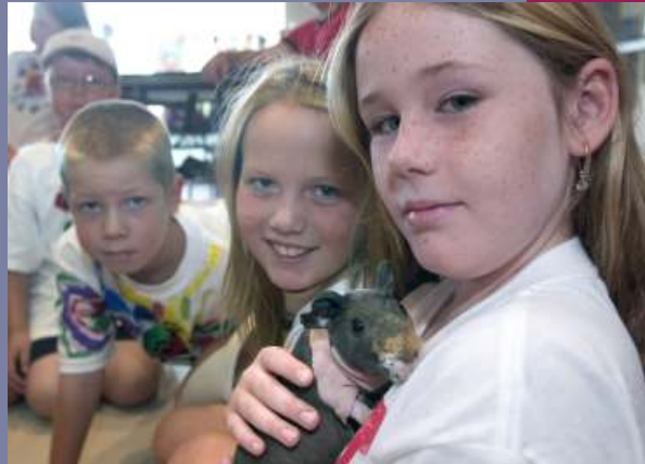
Photo: A summer camp held at the Hamilton/Burlington SPCA helps children to learn empathy for, and socialize with animals. The Hamilton Spectator Summer Camp Fund at HCF subsidized 22 children to attend this camp.

In the summer of 2005, more than 1,000 children attended 22 local camps thanks to The Hamilton Spectator Summer Camp Fund, established in 1984 with HCF. Approximately $115,000 is donated annually from the community to support summer camp attendance for children who might otherwise never have a camping experience due to low income, language barriers, or health problems.