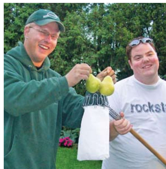
The Hamilton Fruit Tree Project involves local fruit growers and volunteers who help pick the fruit and donate it to those in need.

Just 24 to 48 hours pass from the tree to the food bank making this fruit fresher than most on supermarket shelves, and ending up where it should be: in kitchens, instead of wasting unpicked in local gardens.